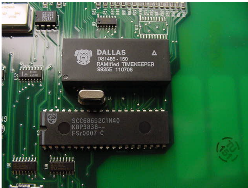
Detail of IMACS 892360 showing Philips DUART.