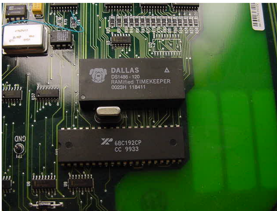
Detail of IMACS 892360 showing Exar DUART.